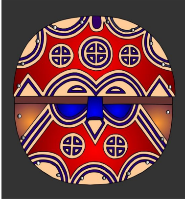
African Tewe mask